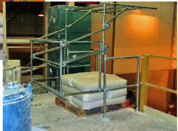
Gate Open to Edge

Tubular steel construction allows clear view of operation whilst reinforcing the sense of security