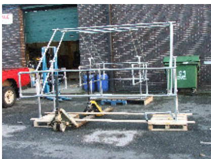
Standard size pallet gate (Rear) with extra large version in front for comparison