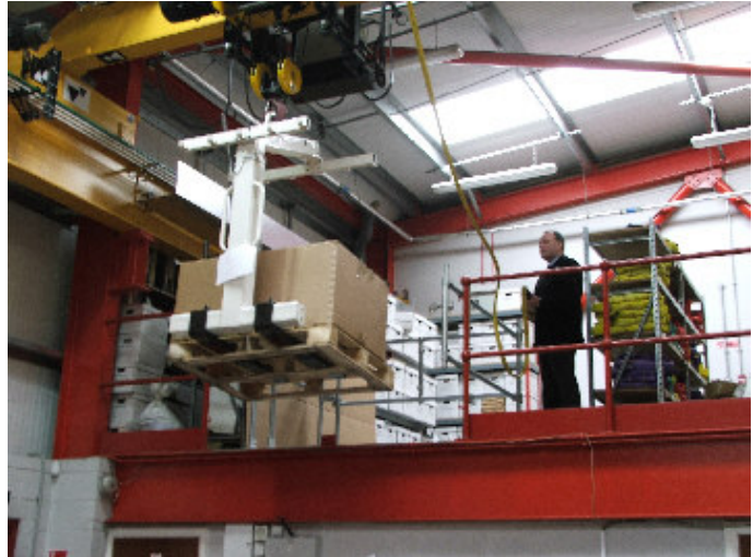
The Hi-Gate in action with an overhead hoist

The usual method is a barrier rope, chain or drop bar guarding the opening. Which, when removed leaves the operator or anybody else exposed to falling through the opening.