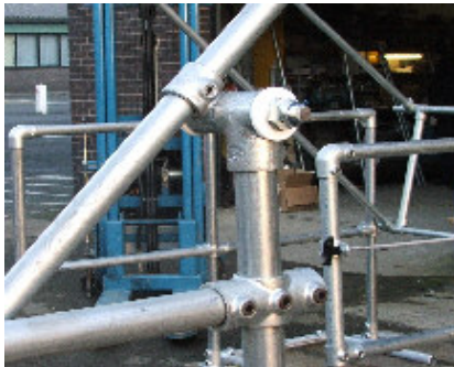
Close-up of new synthetic Maintenance-free bearings fitted as standard on Compact and Standard pallet gates.